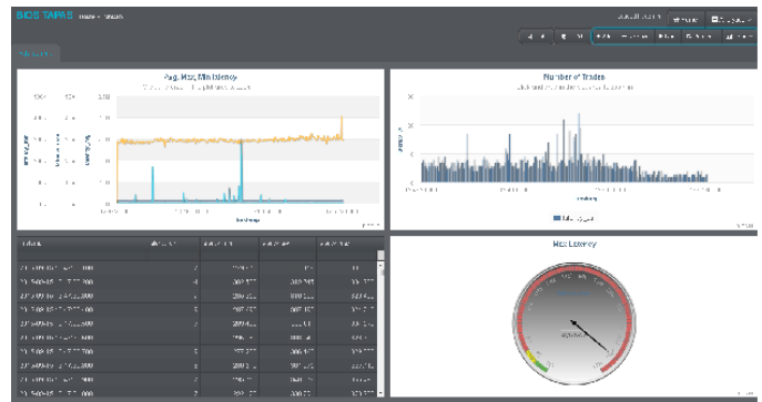
FIG. 2: SCREENSHOT ILLUSTRATING TRADE SUMMARY